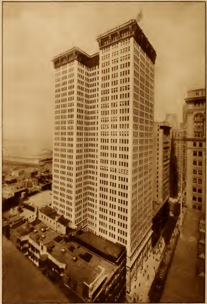
ADAMS EXPRESS BUILDING. An imposing structure giving a wonderful view of the busy harbor. It is one of the best examples of a modern skyscraper.